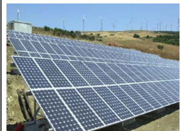
Millennium Electric Panels in a PV Power stations in Italy

Designed to withstand rigorous weather conditions, a junction box is also provided for easy electrical connections in the field, making Millennium's modules the perfect combination of advanced technology and reliability.