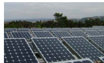
Millennium Electric Grid Connected MSS-PVT Power stations largest in the world from it kind

STC: irradiance level 1000W/m 2 , spectrum AM 1.5 and cell temperature 25°C Specifications and design are subject to change without prior notice.